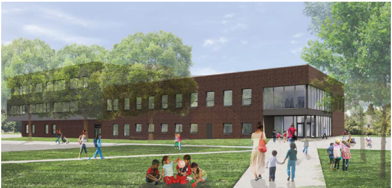
Artist's rendering of the combined Faubion Elementary-Concordia University building, scheduled to open September 2017